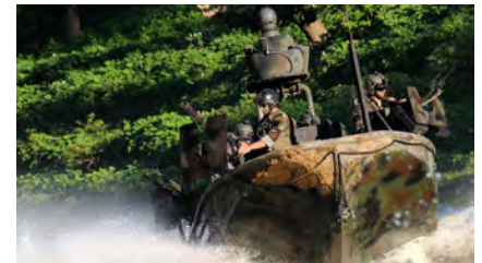
A squadron engages in a live-fire training exercise (top), while a special boat team participates in a drill at the riverine training range at Fort Knox (bottom).