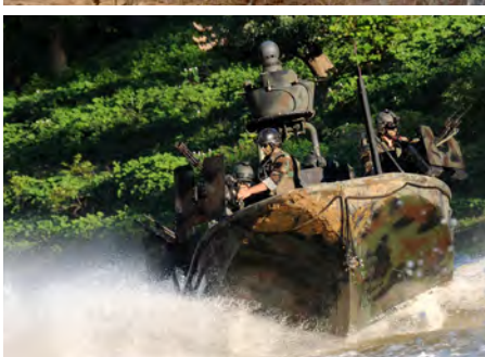
A squadron engages in a live-fire training exercise (top), while a special boat team participates in a drill at the riverine training range at Fort Knox (left).